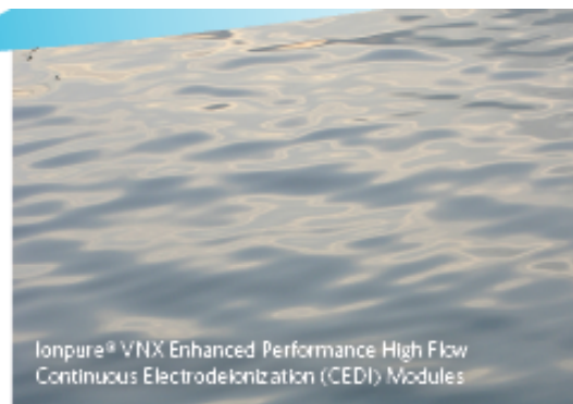
Ionpure® VNX Enhanced Performance High Flow Continuous Electrodeionization (CEDI) Modules